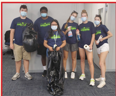
Mercyhurst University Students who helped us clean!

This has been a busy year for Erie DAWN – we sorted, we packed, and we MOVED. With all of that hustle and bustle we still carried on the normal everyday activities. We are so grateful to those who stepped up to help us this year.