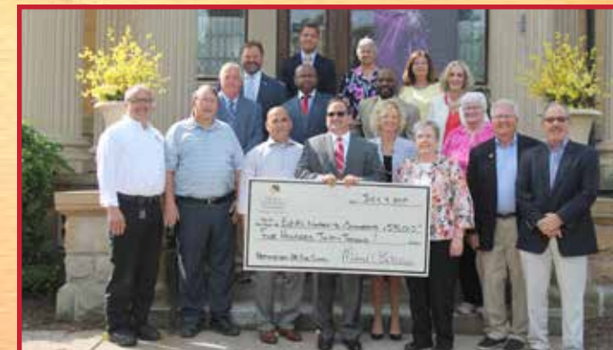
NWPA Food Council disperses Funds

Thank you to the Northwestern PA Food Council who has served as a membership organization for Erie County family-owned grocery stores and local wholesale food suppliers since the 1950s. Recently, the Food Council dissolved, and its board members voted to distribute their remaining assets with assistance from The Erie Community Foundation to some local organizations.