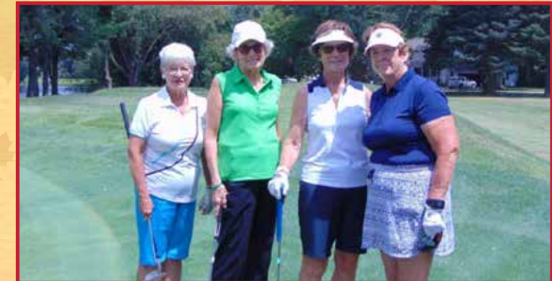
Lady Golfers enjoy the day at "Tee it Up for Erie DAWN"