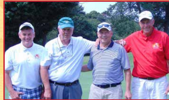
Golfers always happy to support Erie DAWN!