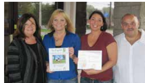
The Sportsman Club supporting Erie DAWN