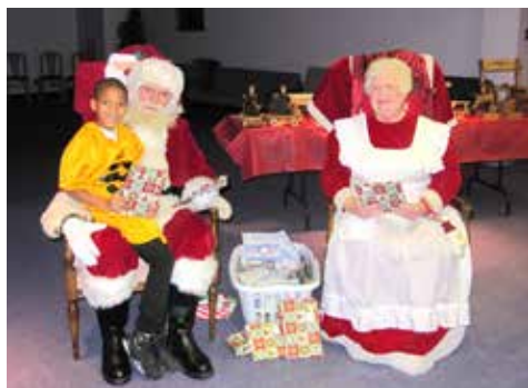
Christmas at Erie DAWN