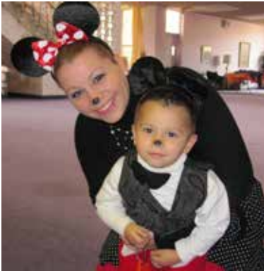
Crystal and her Son