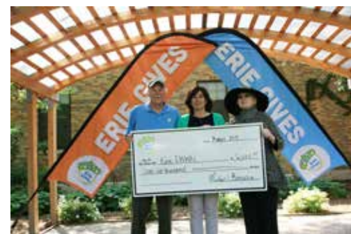
Erie Gives Day 2015

The accompanying notes are an integral part of these financial statements.