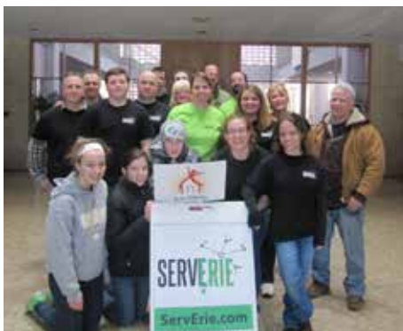
Volunteers from Serve Erie