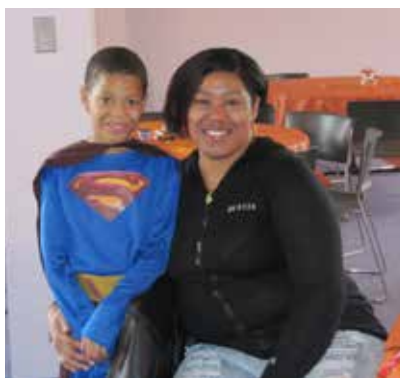
Sade and her son